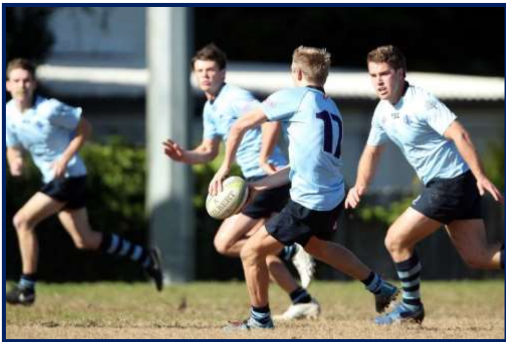
Barbour Cups impressive backline in action against Mosman.